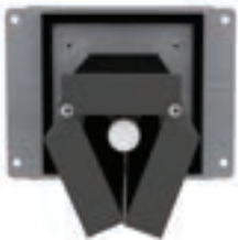
Fig 1. Platinum Pure in "closed" position